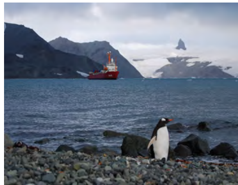
Another view of Admiralty Bay, with the R/V Ary Rongel in the background and a Gentoo penguin in the foreground.

Our trip back home began after this visit. The scientific crew was scheduled to leave Antarctica by aircraft from the Chilean Antarctic base, Presidente Eduardo Frei. We navigated from Admiralty Bay towards Maxwell Bay and waited for the aircraft, a Hercules, to take us home from Antarctica. As a Chilean citizen, I was thrilled to visit "Villa Las Estrellas", a residential area that has a school, a bank, a hospital and other services to support the 80 to 150 people (depending on the season) who live there.