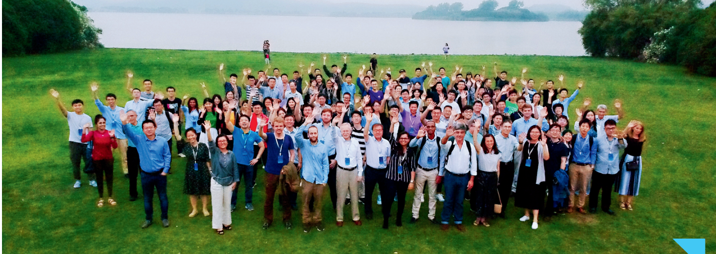
Figure 1. A group picture, taken by a drone, of the participants of the IWMO-2019 meeting in Wuxi, China. In the background is Lake Taihu, one of the largest freshwater lakes in China, which includes some 90 islands and various tourist attractions.