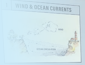
an chrodutton and weather patterns lead to local sea-level adarace, the long term slowing of the GUI Stream, which in value from the GUI of Mexico Into the Nerth Atlance, Ras increased nash could rise along the Atlantic Coast. Angely means effect carries water away from the U.S. East Coast has borned over the past services, wern seawater has long the shores of the Eastern Seaboard. The wreaking ong the shores of the Eastern Seaboard.