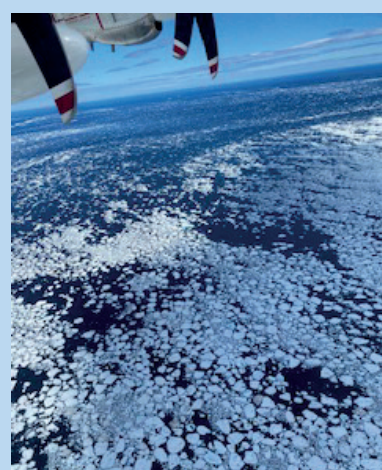
Broken sea ice as seen from the window of the C-130 aircraft.

I started working at the IIP in August 2021 as the Satellite Reconnaissance Branch Chief. It is an interesting time to be joining