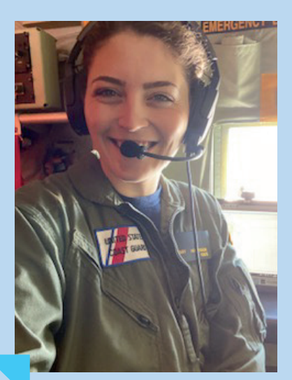
A selfie taken in Newfoundland. Canada

the IIP, as the use of higher resolution satellites is both changing and improving how operations are conducted. Except for the years during the two World Wars, the Ice Patrol has been