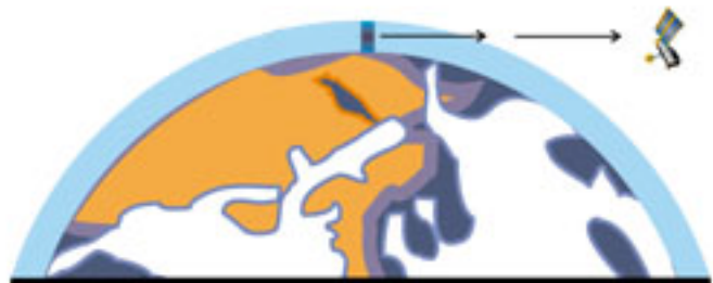
C. Limb Emission