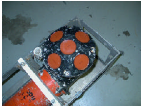
Figure 2. Top view of VADCP showing adjustable roll clamps (photo taken after recovery and pressure washing).

Having tackled the problems of getting the instrument in the water and getting it interfaced with the LEO-15 system, we were left with the problem of being able to remotely send it commands and to view and retrieve data.