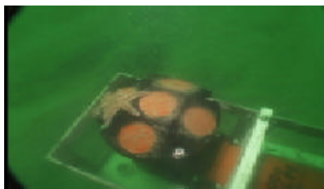
Figure 3. Biological interaction by mating starfish on VADCP.

Data collected by the ADCP were relayed along the LEO-15 cable back to the Rutgers Marine Field Station in Tuckerton and logged and displayed on a purpose-built computer we left connected to the field station's network. Since this machine had a "real world" IP address, we were able to communicate with it using a commercial remote control package for computers called Netop Remote©, which is less susceptible to break-ins by unauthorized users than other similar software packages. With this package installed, we were able to sit behind a workstation in Norfolk, VA and have full control over the logging computer in New Jersey. Later in the season, when Dr. Gargett was in Canada and I went on vacation, we were both able to use laptops to remotely control the installation and check data quality. Netop Remote© allowed scheduled batched downloads of VADCP data from the installation site to a workstation in Norfolk, VA on a daily basis. Without this critical piece of the puzzle, this project would have been impossible.