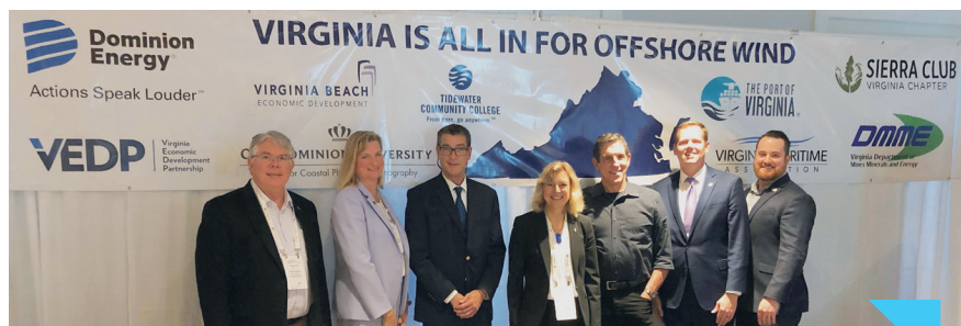
Figure 2. CCPO planned and executed Virginia's largest ever presence at AWEA's annual Offshore WINDPOWER conference, held this year in Boston. Logos on the banner represent supporters of the Virginia booth at the meeting.