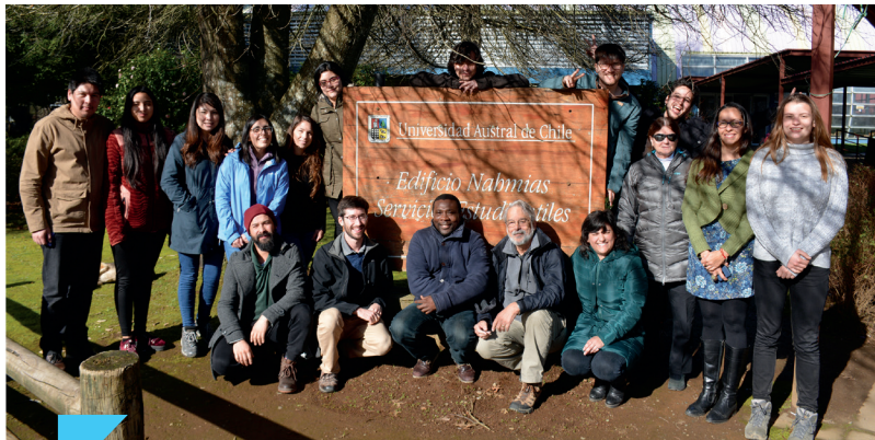
Participants in the 2019 Austral Winter Institute course on biogeochemical modeling and data assimilation.

The focus on food webs continued in the week 2 course on connectivity, sustainability and ecology of marine