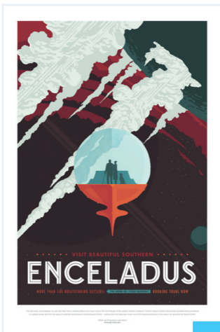
Figure 1. Mock travel advertisement for Enceladus, part of the “Visions of the Future” poster series created by The Studio at JPL.

I spent this past summer working at the NASA Jet Propulsion Laboratory (JPL) in southern California. It was an extremely rewarding experience, both emotionally and practically. There is a palpable energy on the campus, undoubtedly stemming from the highly demanding, highly rewarding nature of the work being done. Having only experienced the relative independence of academia, it was valuable to experience the deep vertical supervisory structure, which ensures that even the smallest tasks fit into NASA's larger, long-term goals. However, such an overarching vision does not mean creative approaches are not taken to reach it. A notable example is The Studio at JPL, which is essentially a team of artists who contribute to everything from engineering design to landscaping. I particularly enjoyed the “Visions of the Future” 1 posters, which are a series of mock retro travel ads for celestial bodies created simply to decorate a bare hallway (Fig. 1).