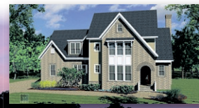
ABT CUSTOM HOMES $669,900