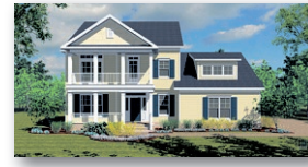
SASSER CONSTRUCTION $549,900