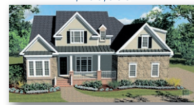
LES ORE CONSTRUCTION $679,900