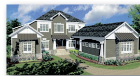
CLARKE WHITEHILL $750,000